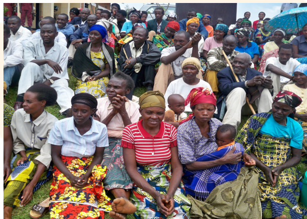
Parents waiting for Information on the Project.