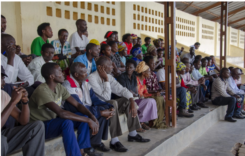
Farmers who attended the community debate held in Nyanza on July 3, 2019