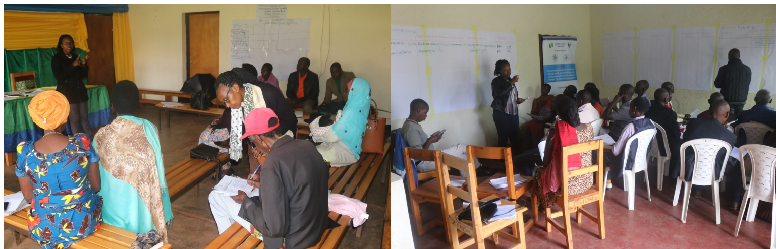
Photo: Farmers in Kayonza and Nyanza during the collection of their priority needs

From 24 th October to 15 th November 2019, Transparency International Rwanda with implementing partners Imbaraga in Kayonza and SDA Iriba in Nyanza, collected farmers' priority needs to be considered in districts' performance contracts "Imihigo" of 2020-2021 fiscal year.