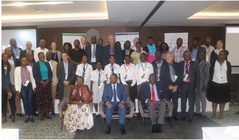
Participants of the social Accountability Symposium hosted in Kigali by Transparency International sRwanda (TI-RW) on 26-27th September, 2019