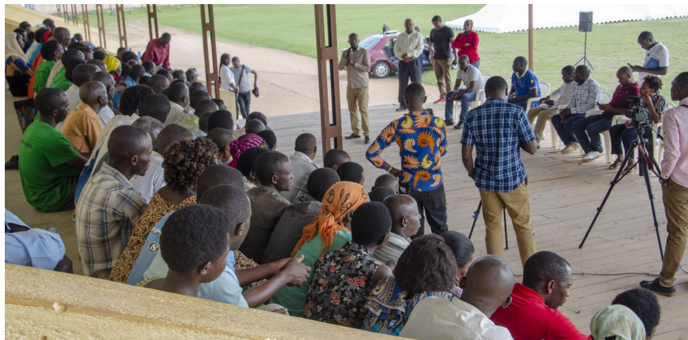
The debate made it possible for farmers to interact with district officials who directly provided response to the issues raised