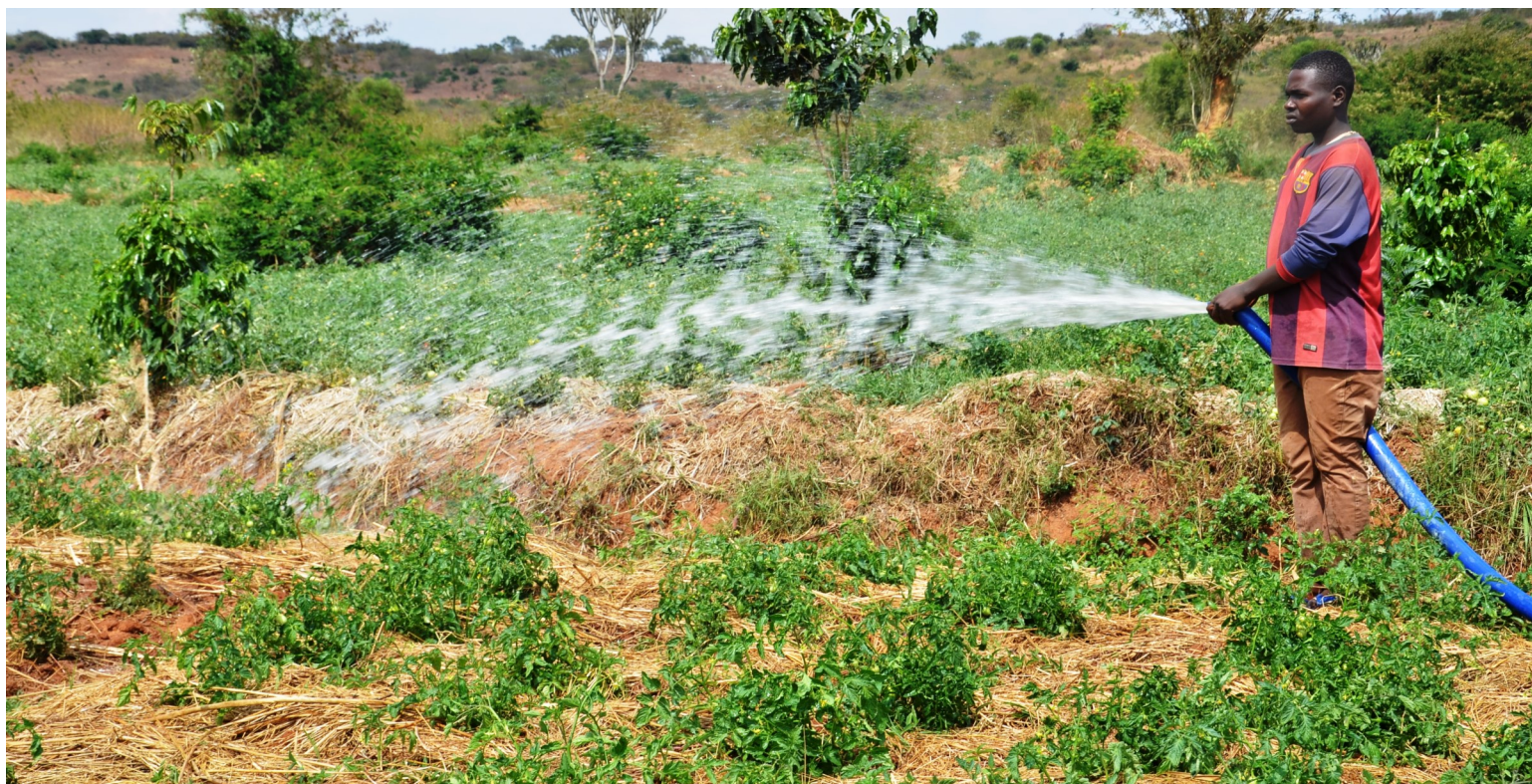
Farmers have expressed the need to get government subsidy on irrigation machines and pumps as a way to increase their production

Transparency International Rwanda (TI-RW) launched the findings of the survey on farmers' satisfaction with their participation in agriculture projects planned in Imihigo in Nyanza and Kayanza Districts.