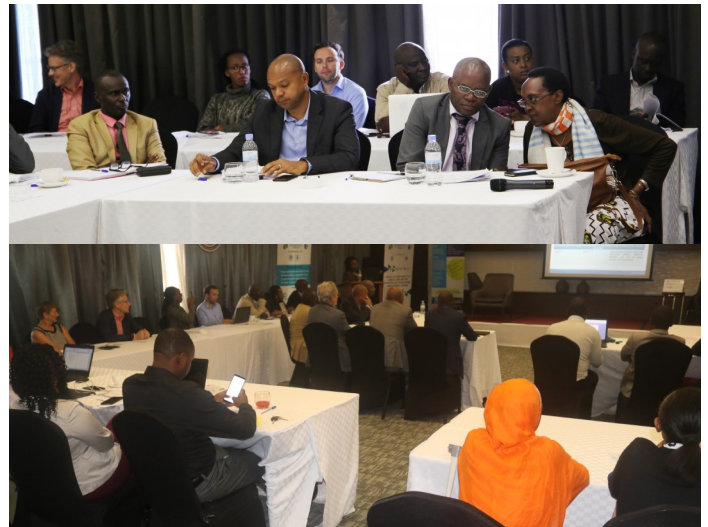
Participants in this project's Stocktaking and Forward Looking Dialogue on Social Accountability in Agriculture