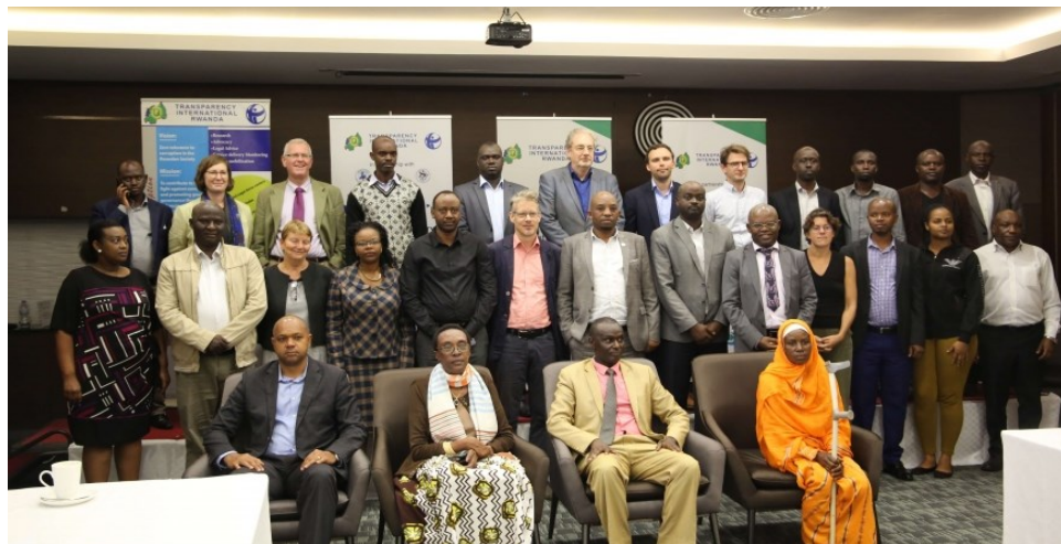
Participants of the stocktaking and forward looking dialogue

About the channels of communication, farmers acknowledged that they mostly express their views through farmers' cooperatives (73.12%) and community meetings (68.6%).