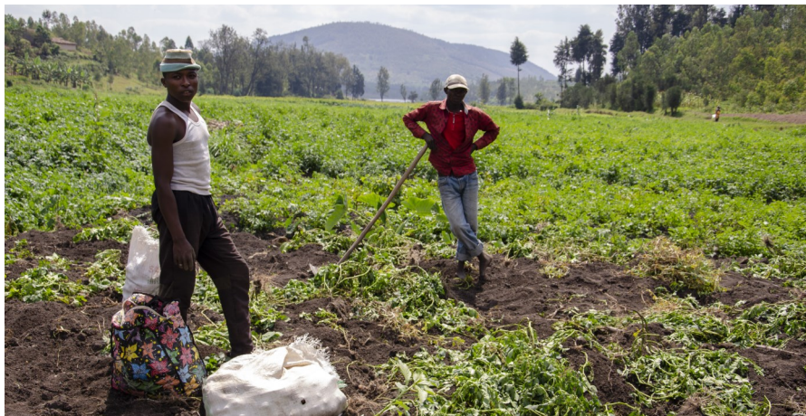
The federation of three cooperatives in Nyanza paid Rwf692,000 while they had been charged 5.5 million

Since the beginning of 2019, most of Nyanza cooperatives lamented to have been charged unprecedented land lease fees. Transparency International Rwanda (TI-RW), through this project, advocated for the normalization of the fees as some cooperatives were supposed to pay for the extra hectares that they do not own while others had to pay up to 10 times of the real fees.